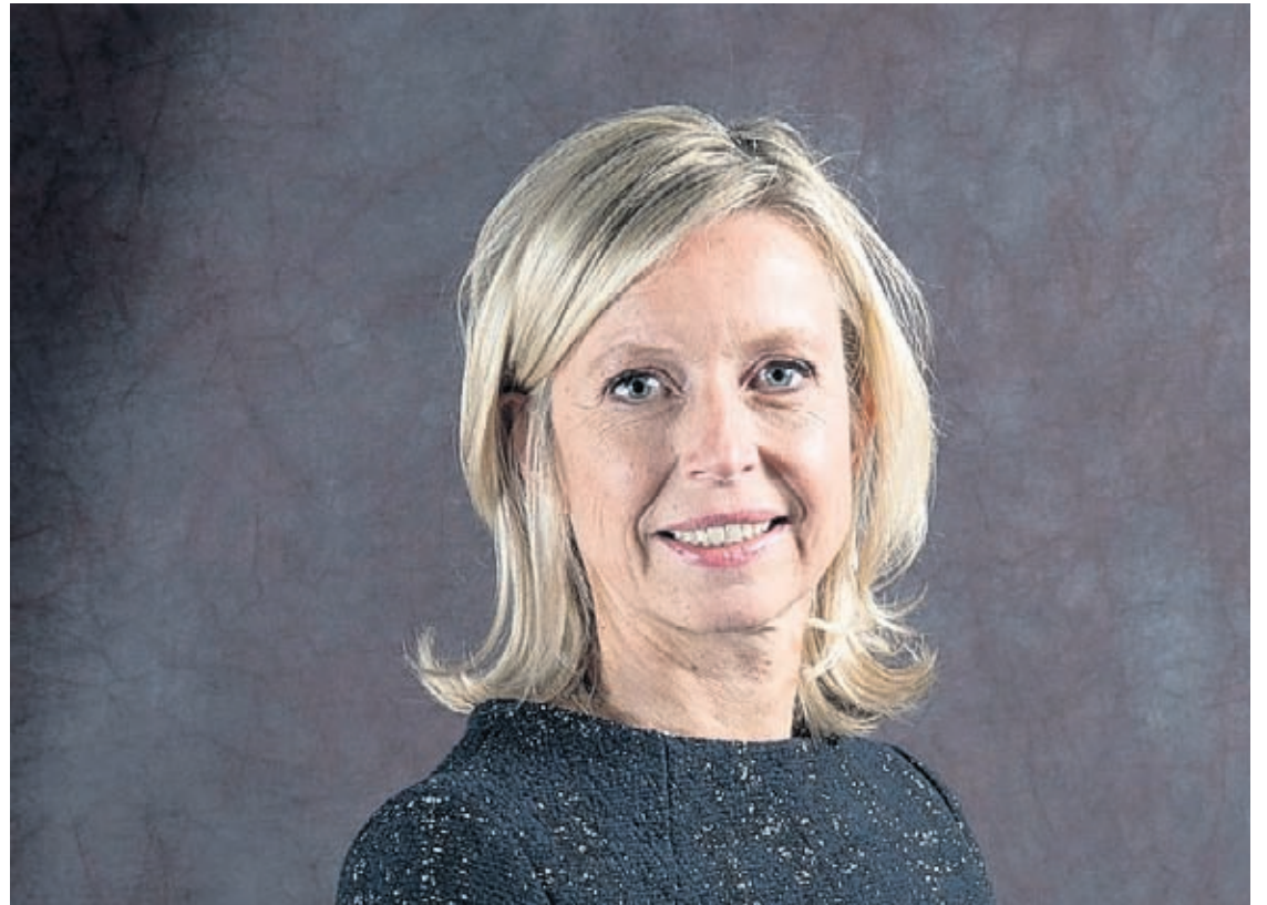
nos placentero si e minister no haci locual e kamer bisa. E ta incomprendible.'

Kox a acusa Ollongren di ignora e boluntad di parlamento pa motibo cu e no a acepta pa vries e huurnan. “Un minister cu no ta reconoce cu cientos di miles di persona ta den dificultad ta creando problema”, el a bisa. TA probabel cu e tema lo ser lanta ora cu e senado sinta awe diamars, Knox a bisa. E lo ta un combersacion me-